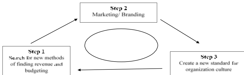
Figure 2. Strategy development model of private higher education for the

The strategy development model of private higher-education institutions for the new generation is shown in Figure 2.